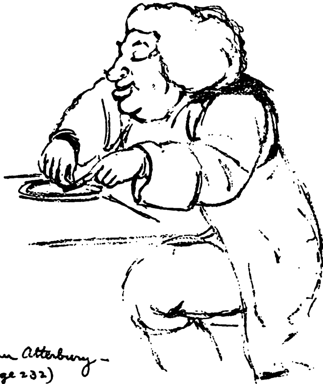
Dean Atterbury - (Page 232)